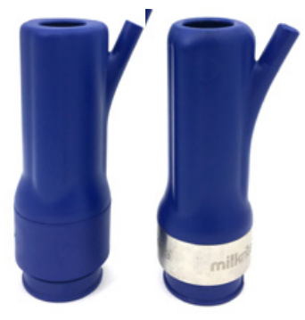
Fits Milkrite® Shell with plastic or stainless steel weights