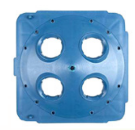
Square plate only required with cover